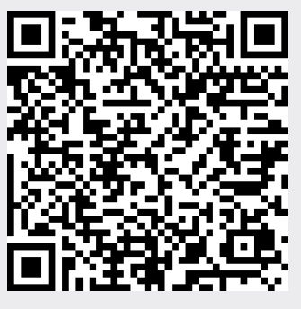
BOOK AN APPLICATION TEST OR BUY PRODUCTS